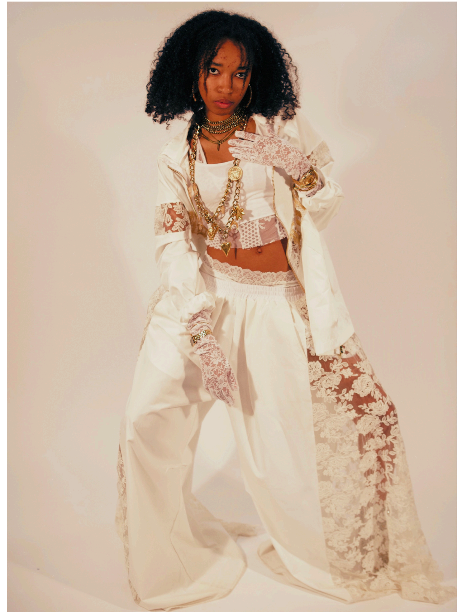
Full Body 6