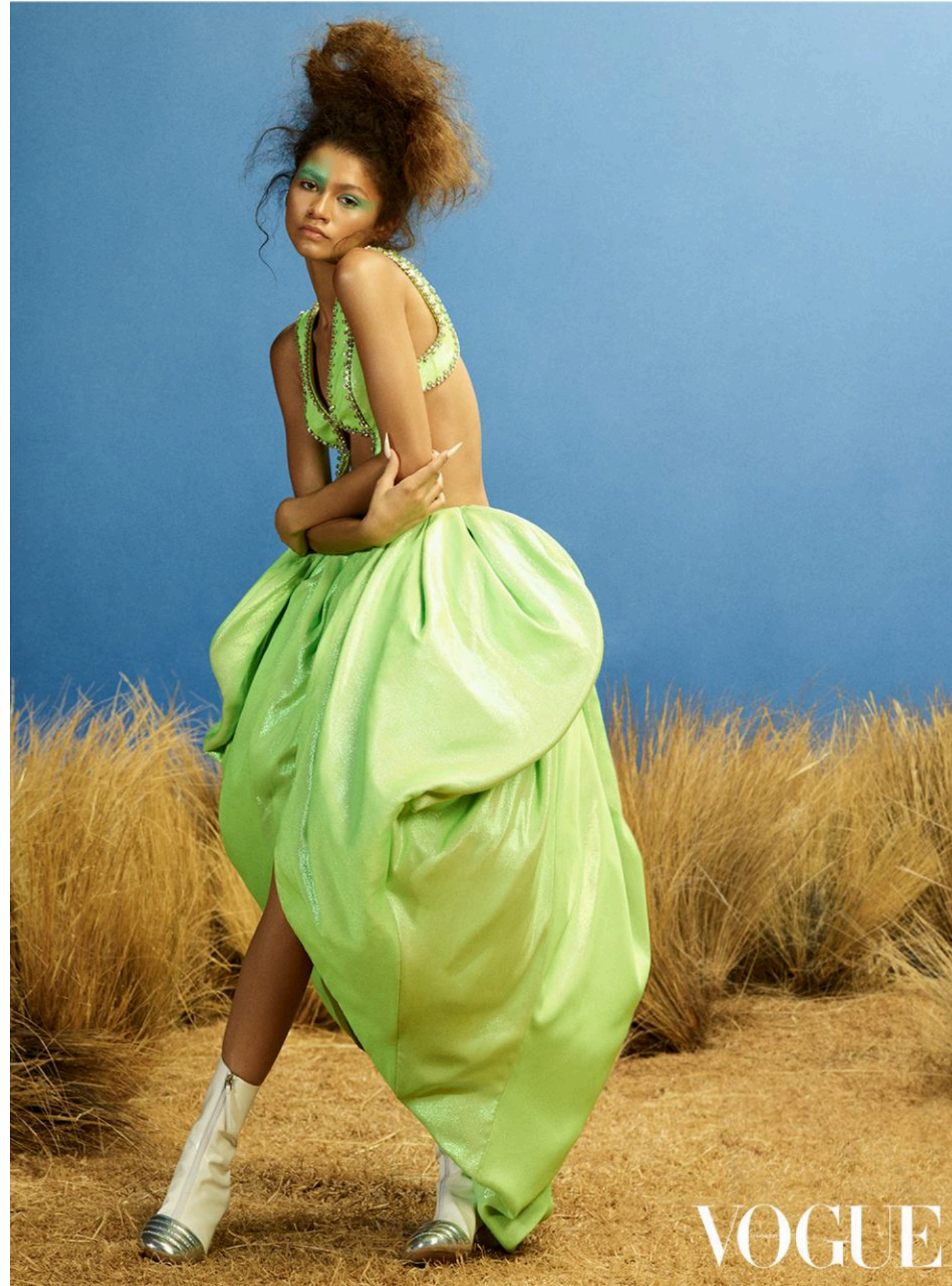
Zendaya, Vogue Hong Kong Cover and Shoot, 2020