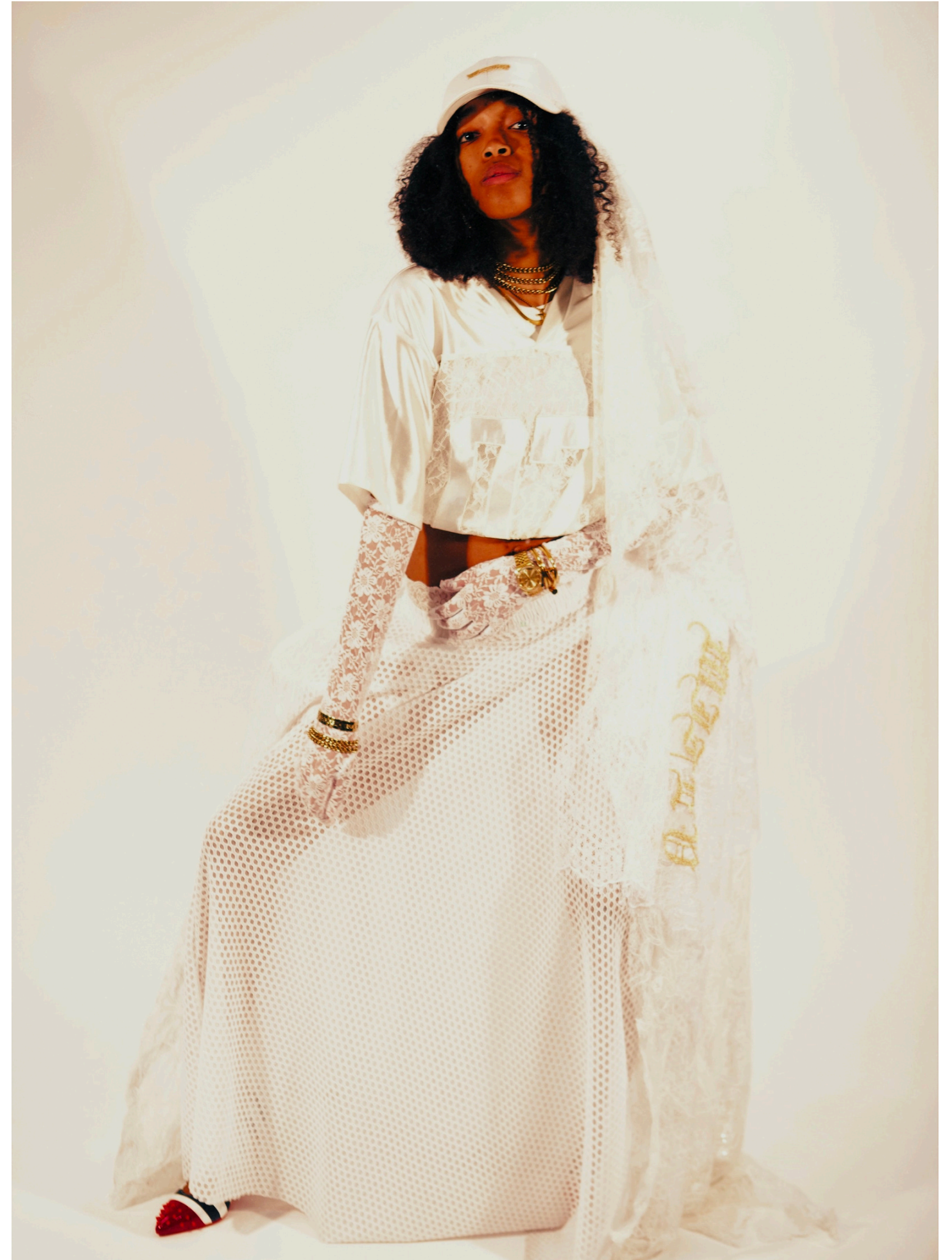
Full Body 3