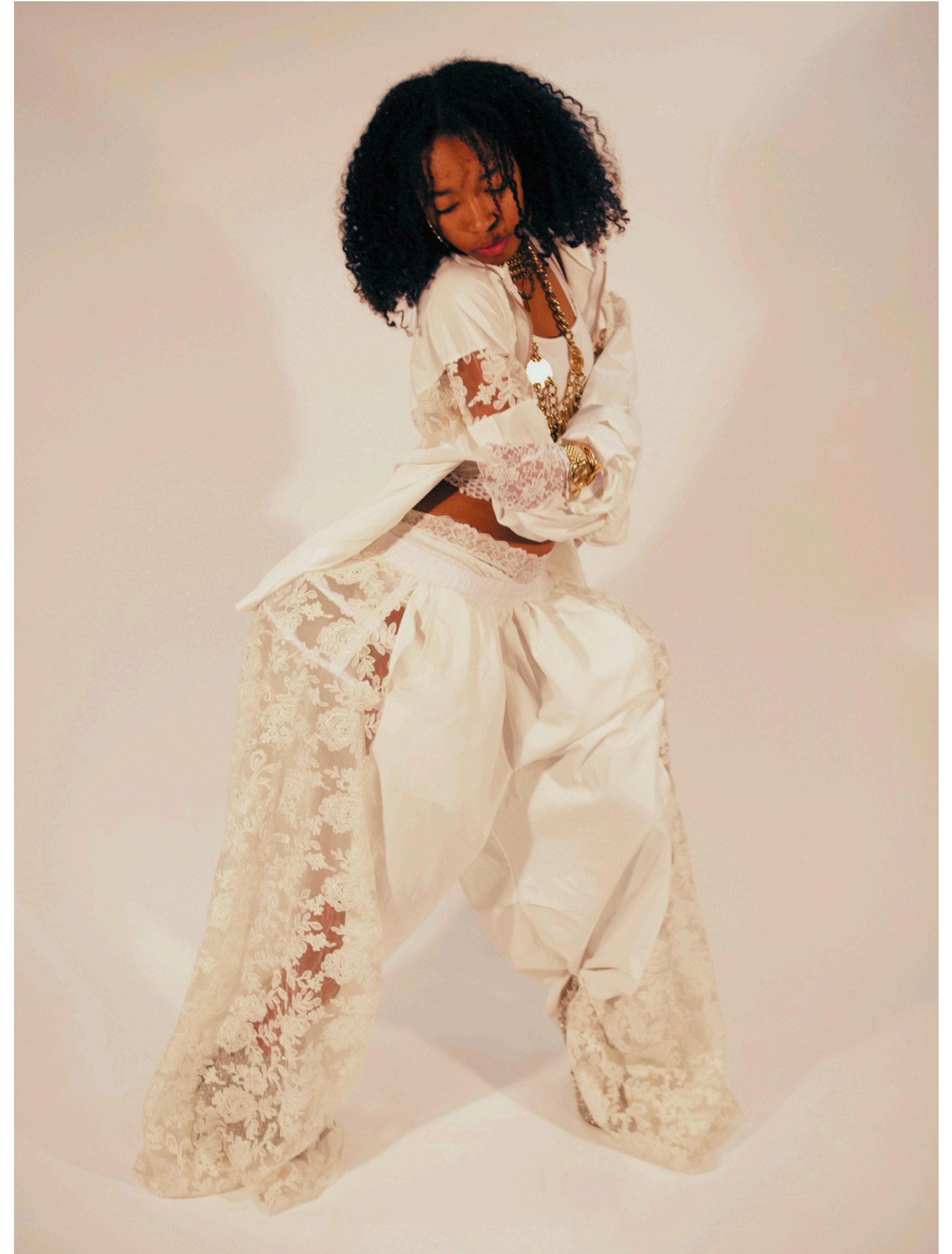
Full Body 5