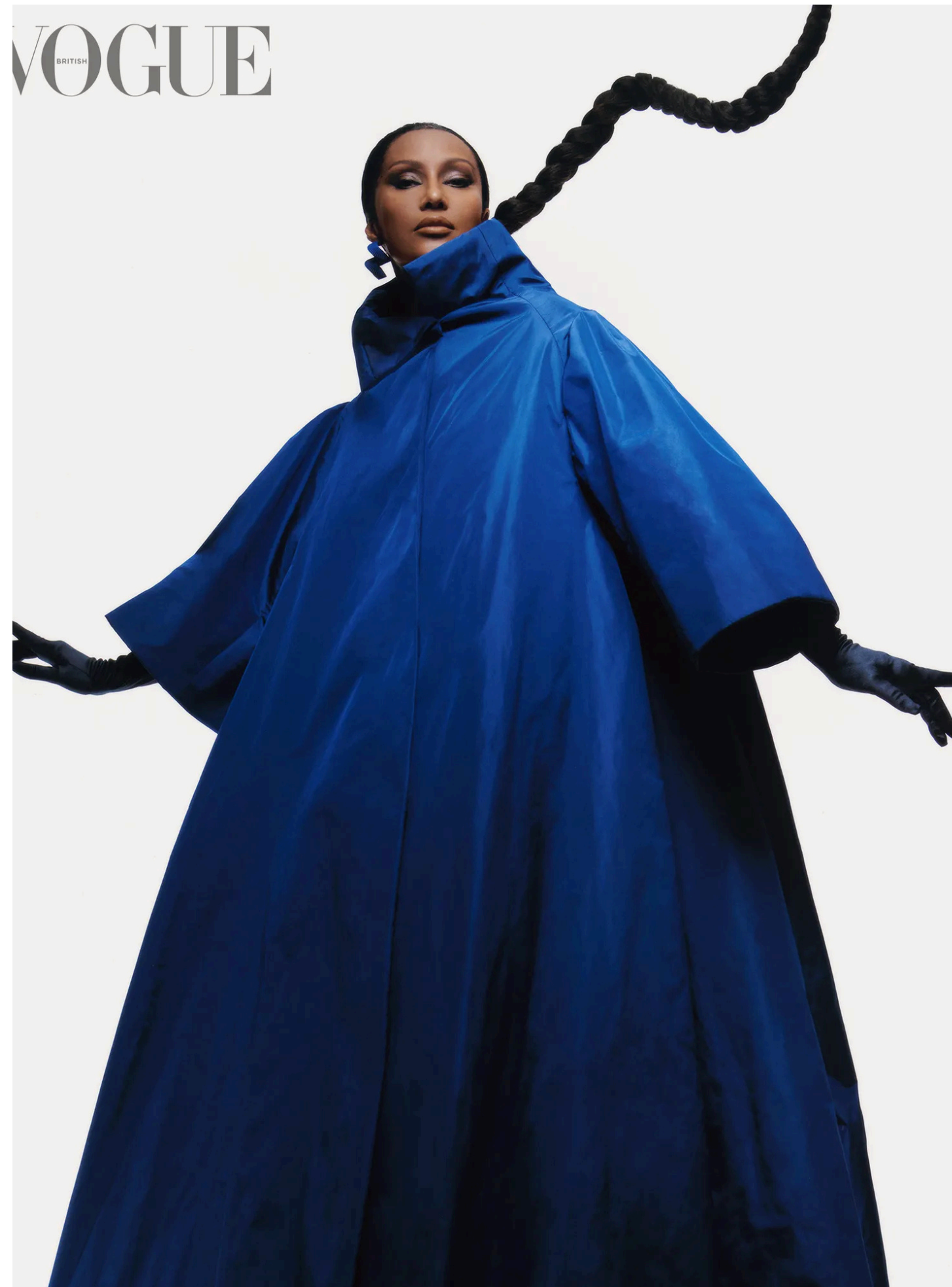
Iman, British Vogue Cover and Shoot, 2023