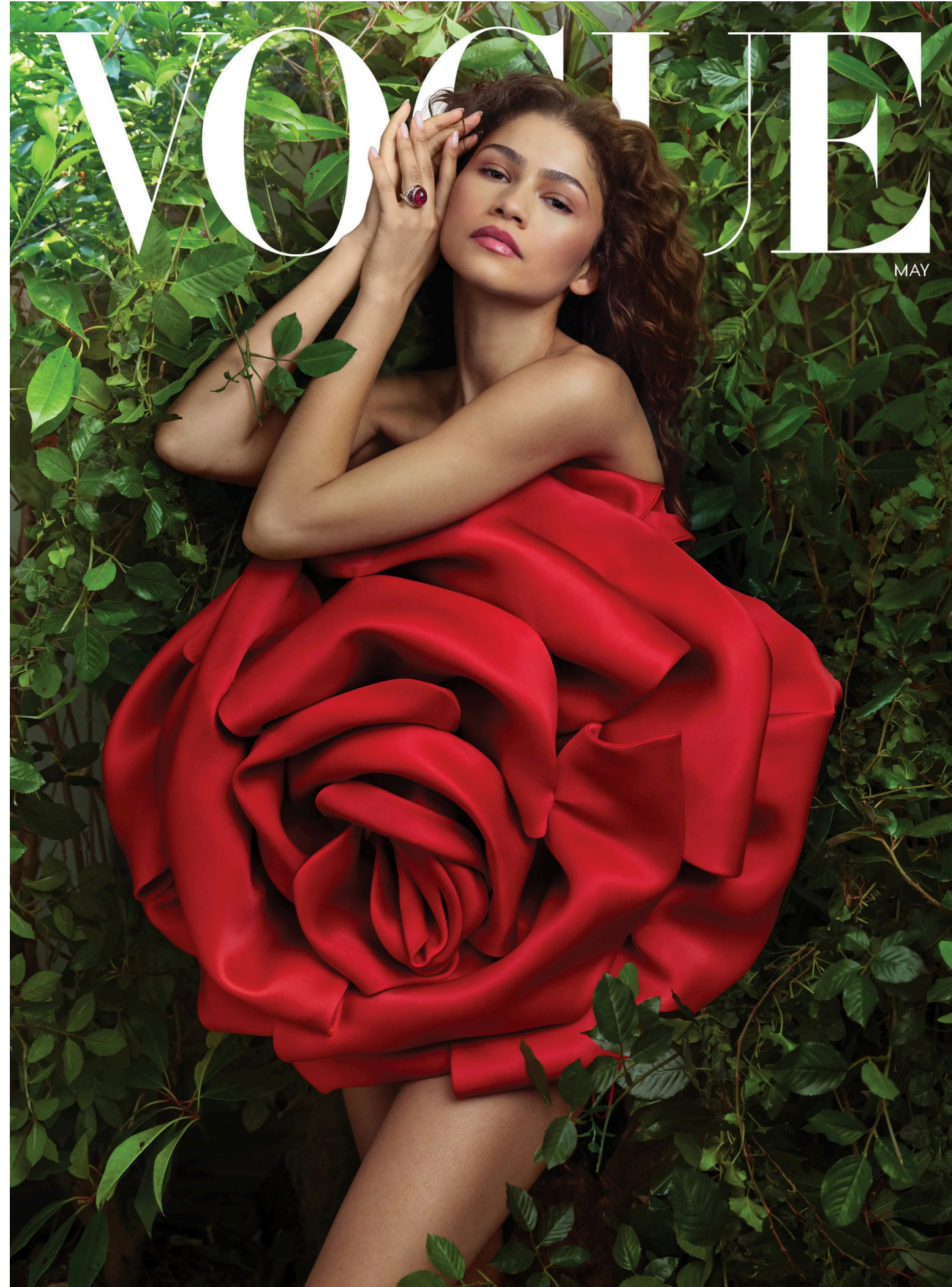
Zendaya, British Vogue Cover and Shoot, 2024