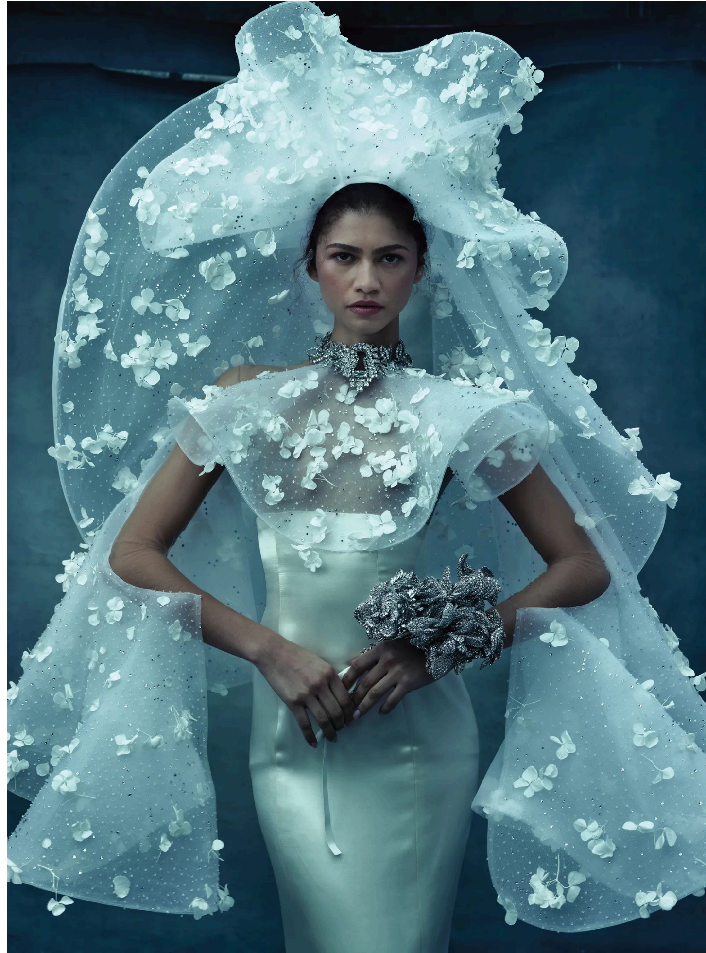
Zendaya, British Vogue Cover and Shoot, 2024