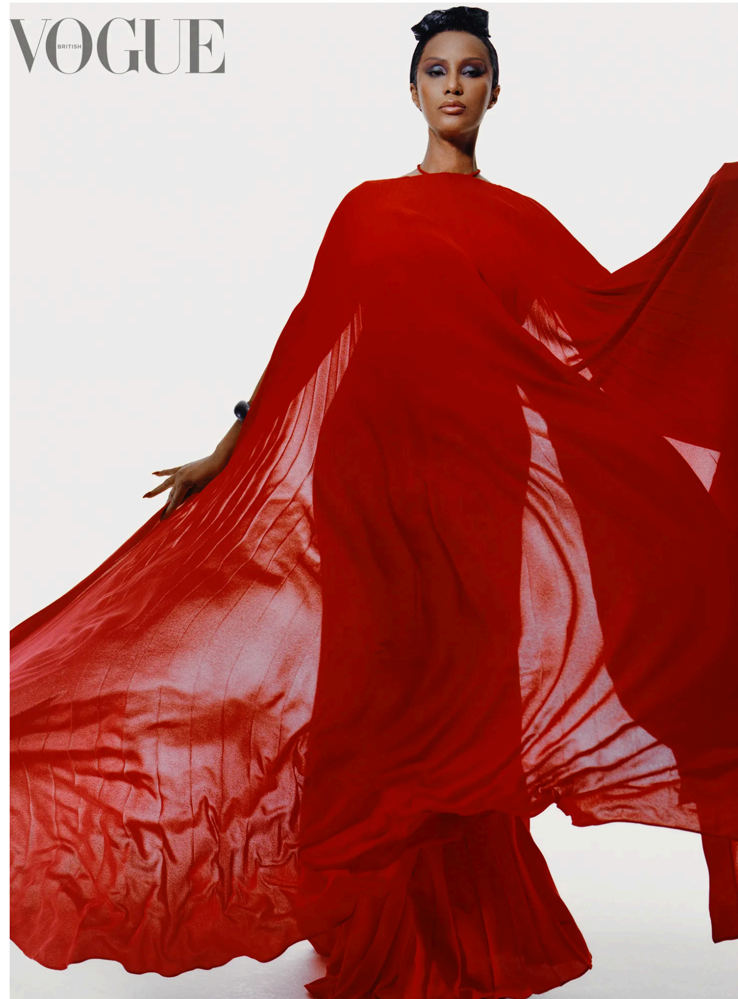
Iman, British Vogue Cover and Shoot, 2023