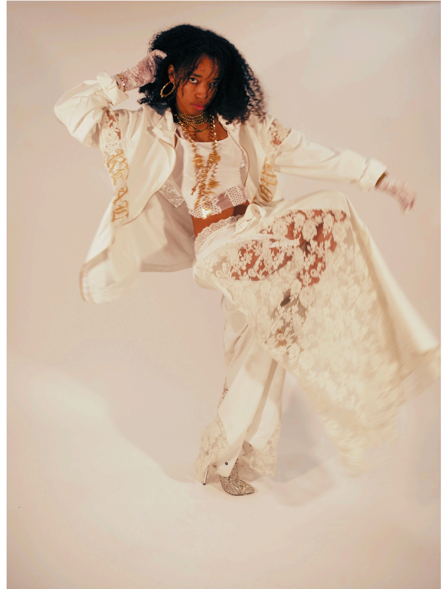
Full Body 4