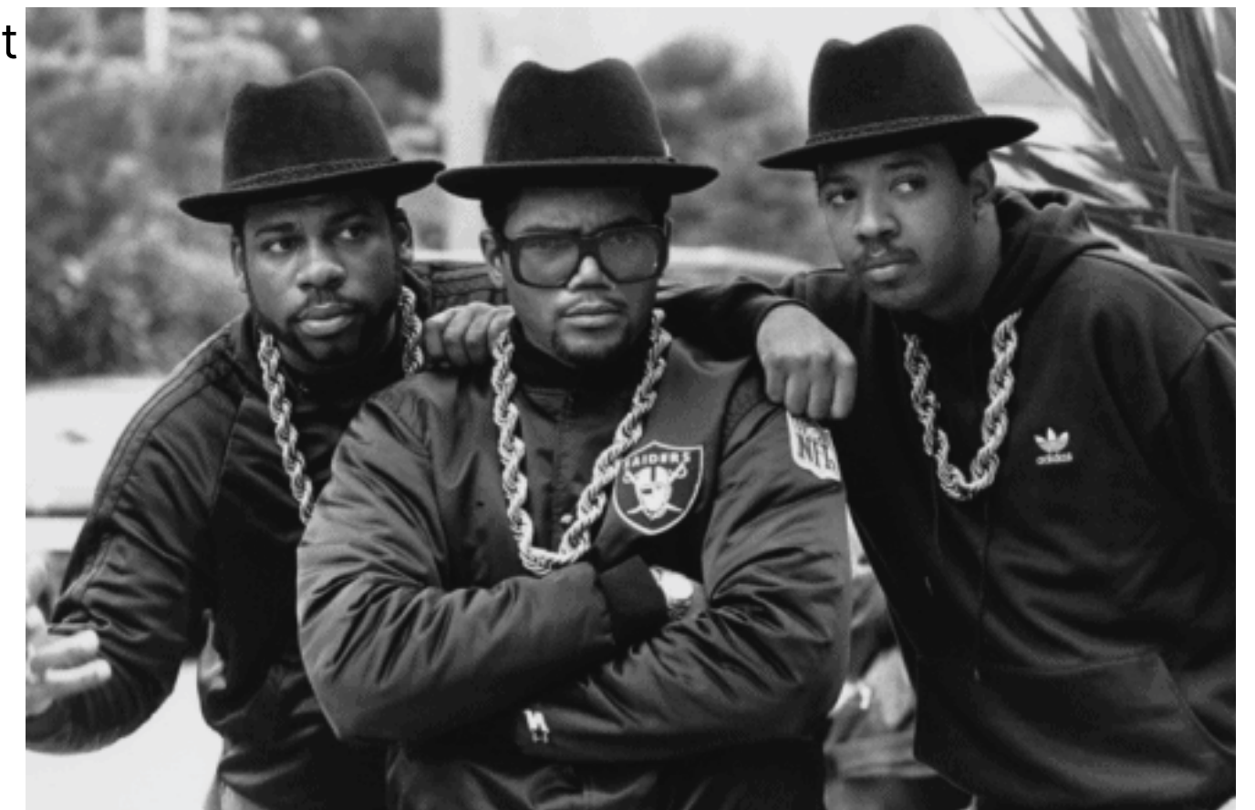
Top: LL COOL J and Bottom: Run-DMC