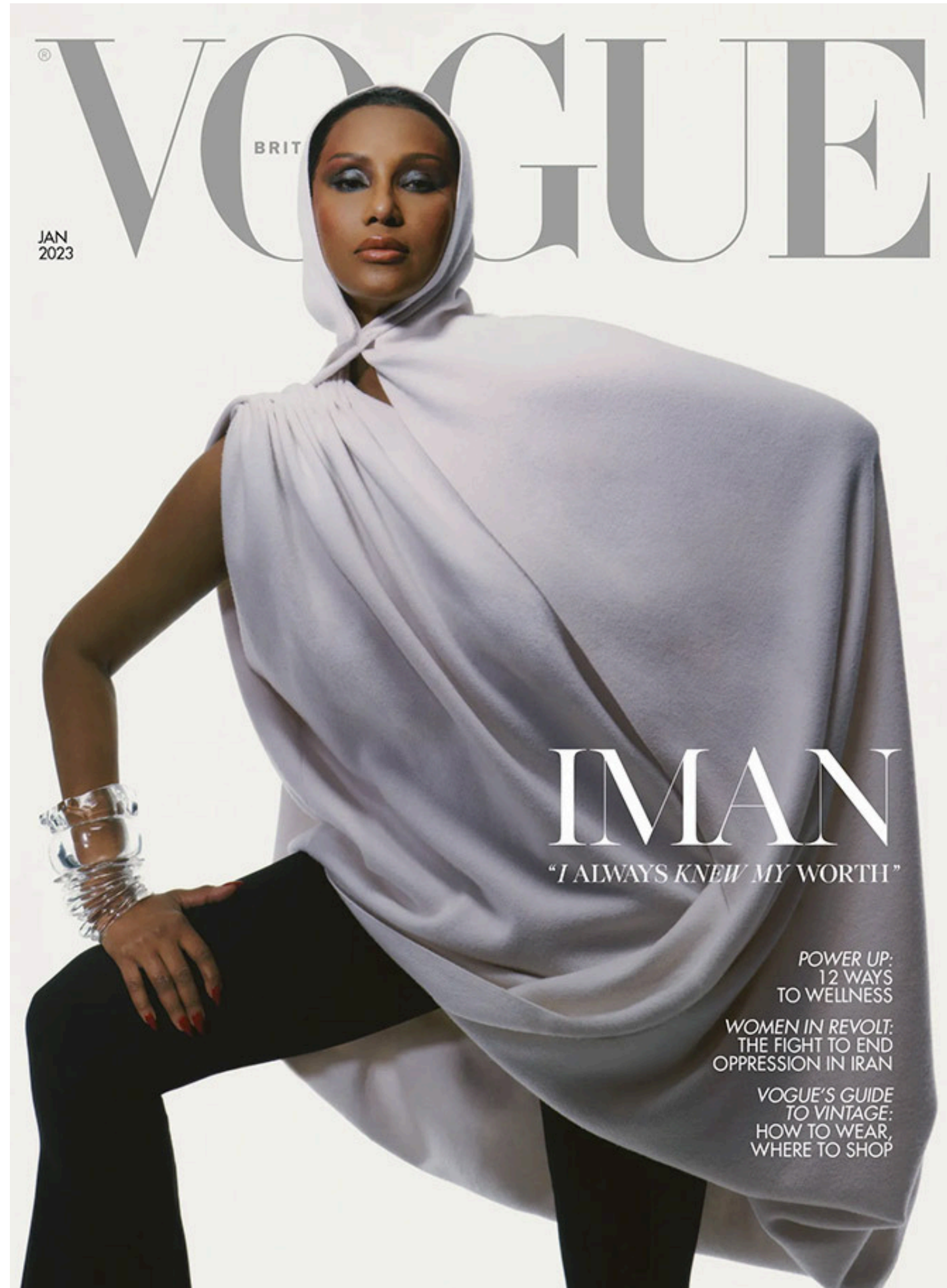
Iman, British Vogue Cover and Shoot, 2023