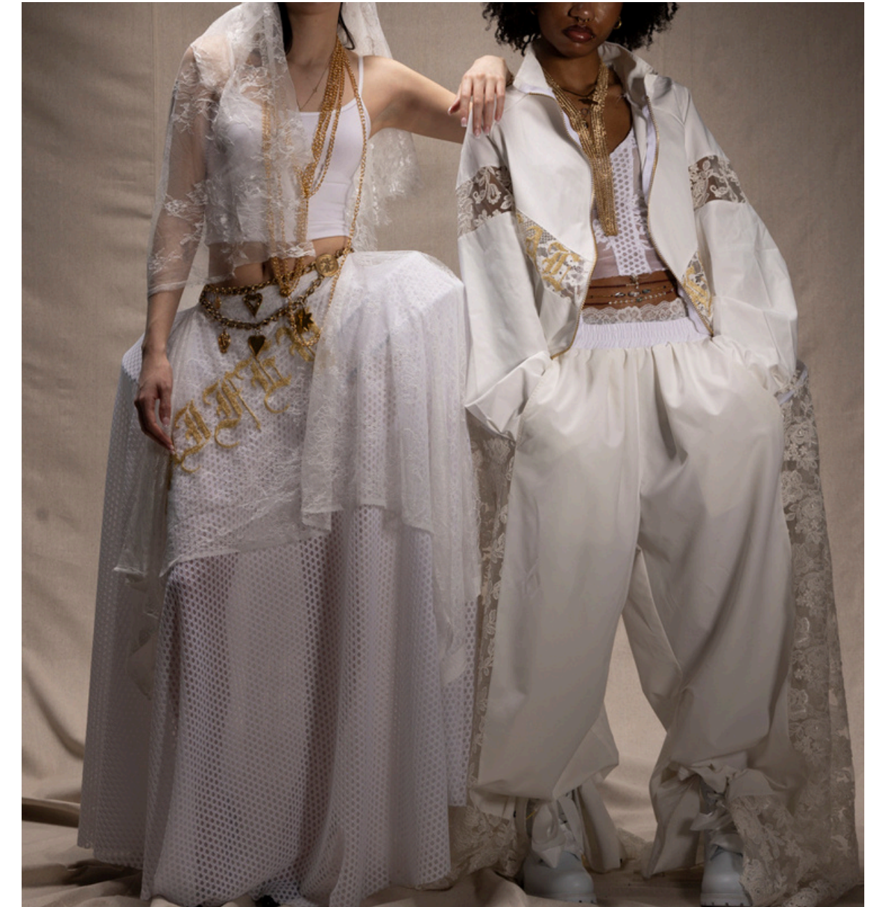
Original Imagery of the “Real Love” collection featuring Gold Embroidered Butle Hip Skirt and Lace Embellished Bridal Tracksuit