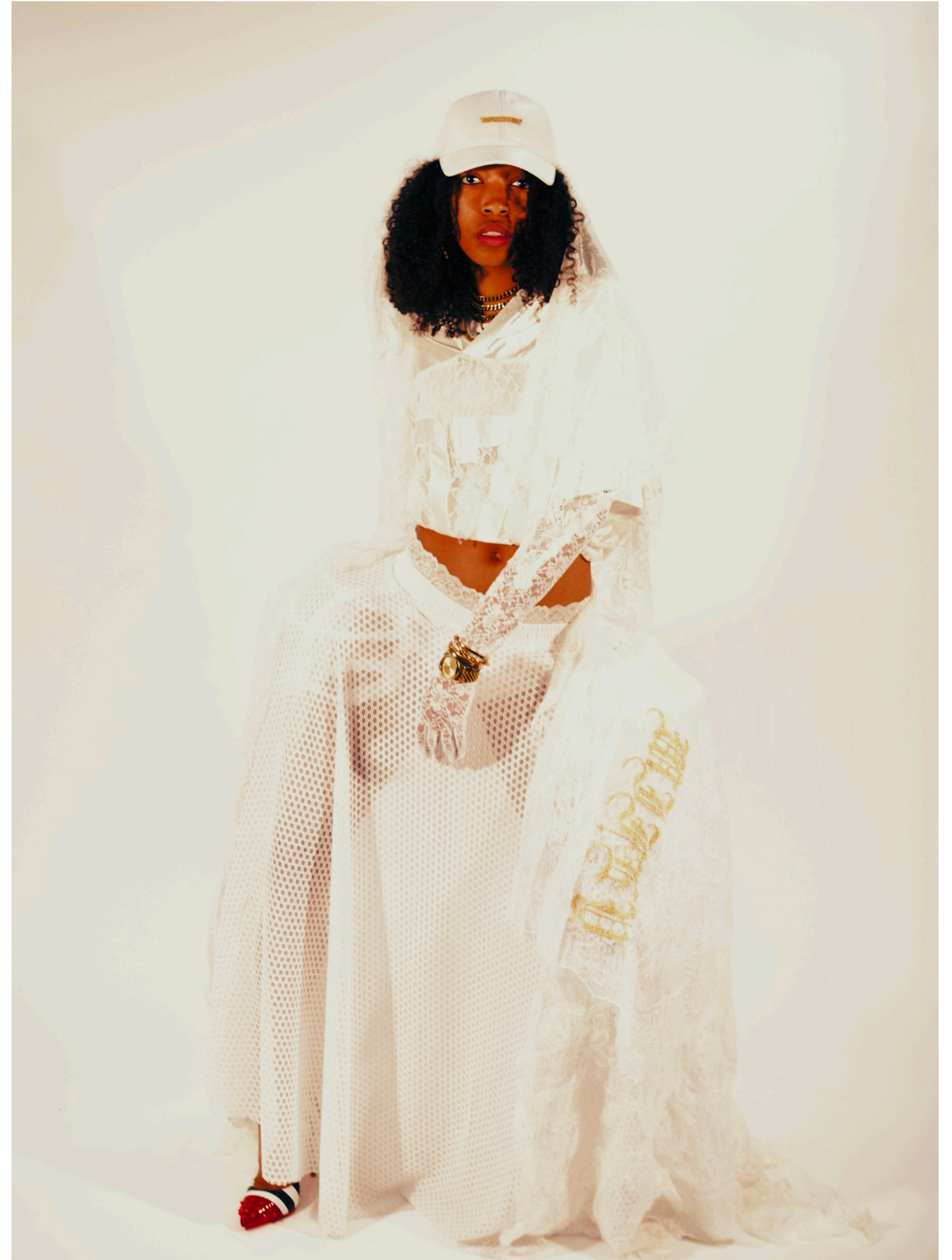
Full Body 1