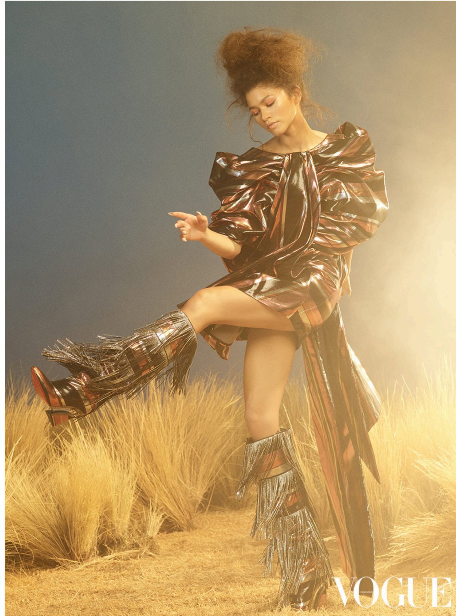
Zendaya, Vogue Hong Kong Cover and Shoot, 2020