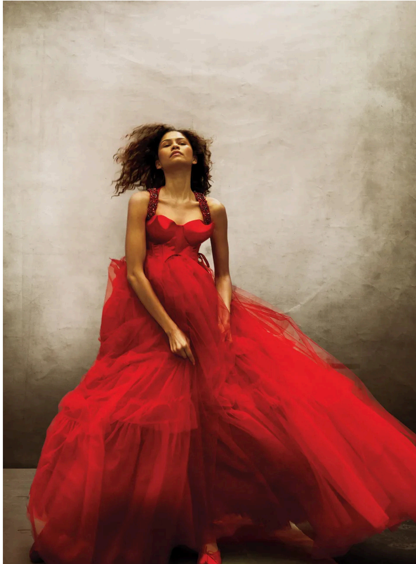
Zendaya, British Vogue Cover and Shoot, 2024