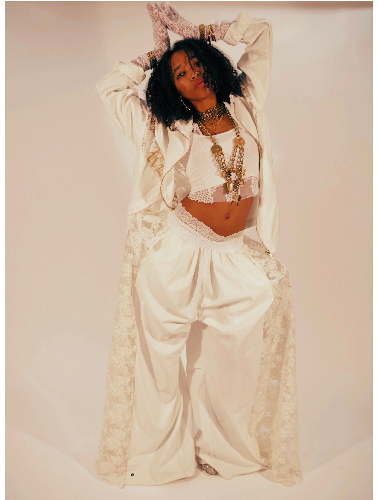
Full Body 2