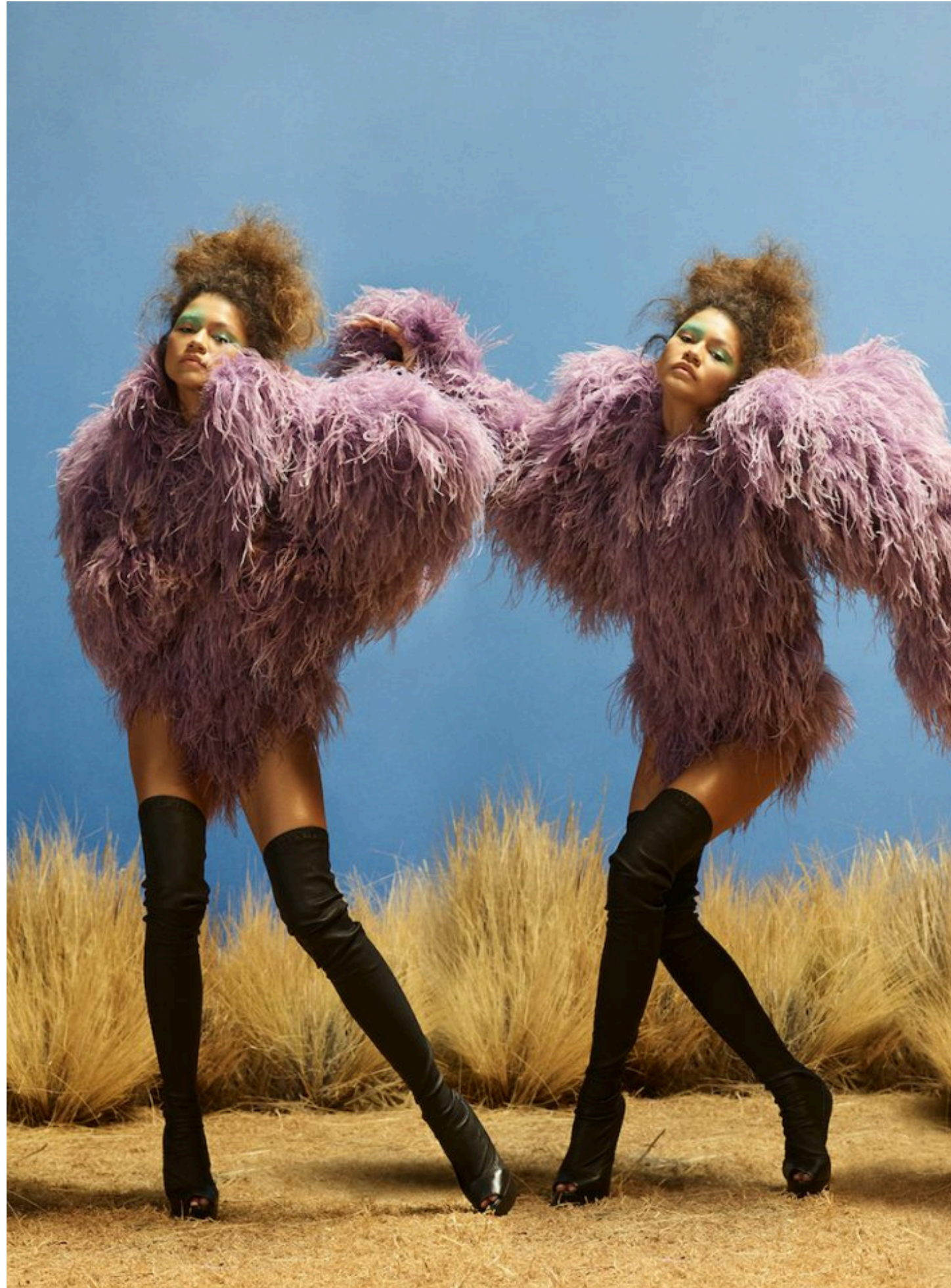
Zendaya, Vogue Hong Kong Cover and Shoot, 2020