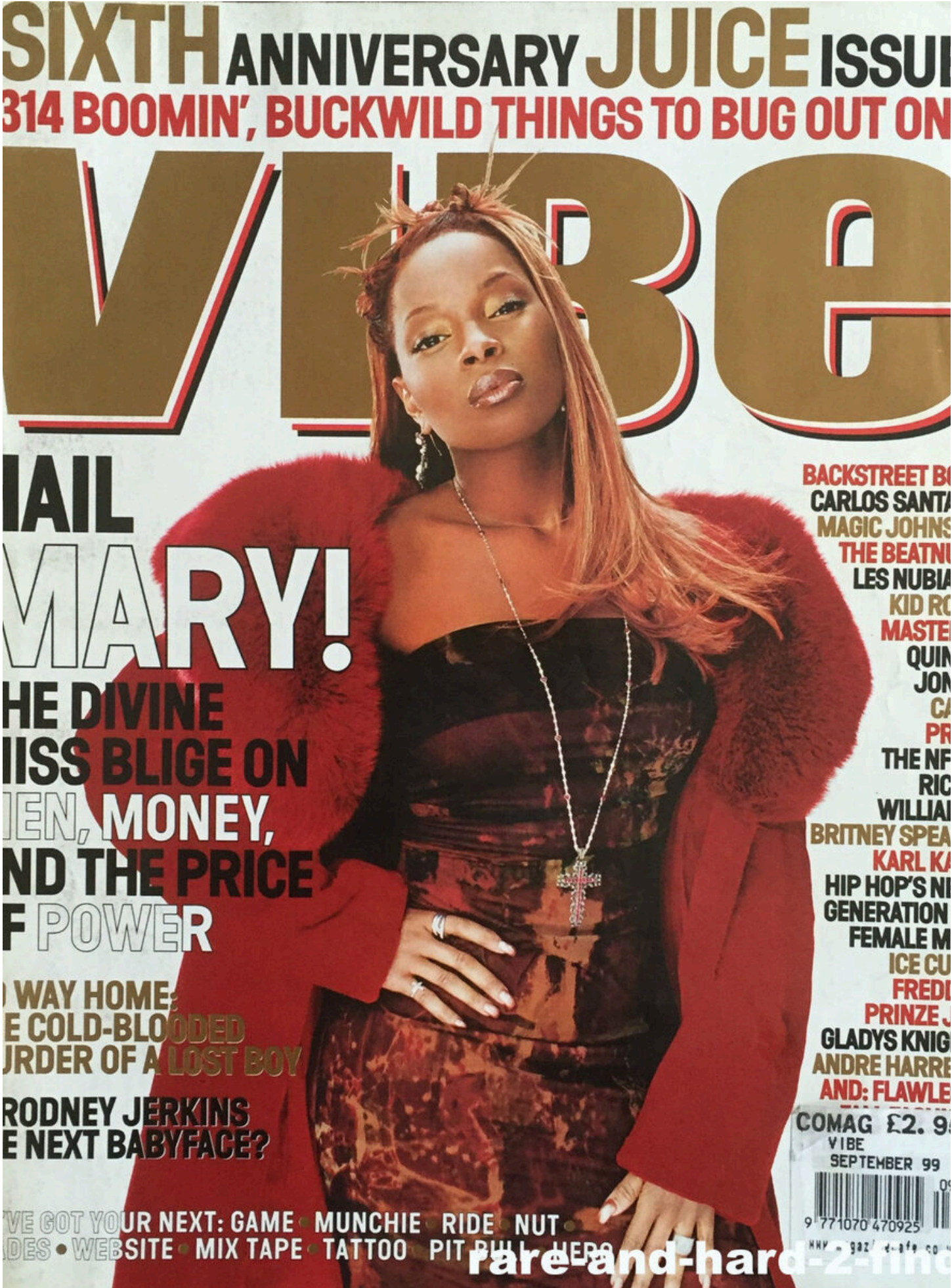
Mary J Blige, Vibe Magazine Cover, 1999